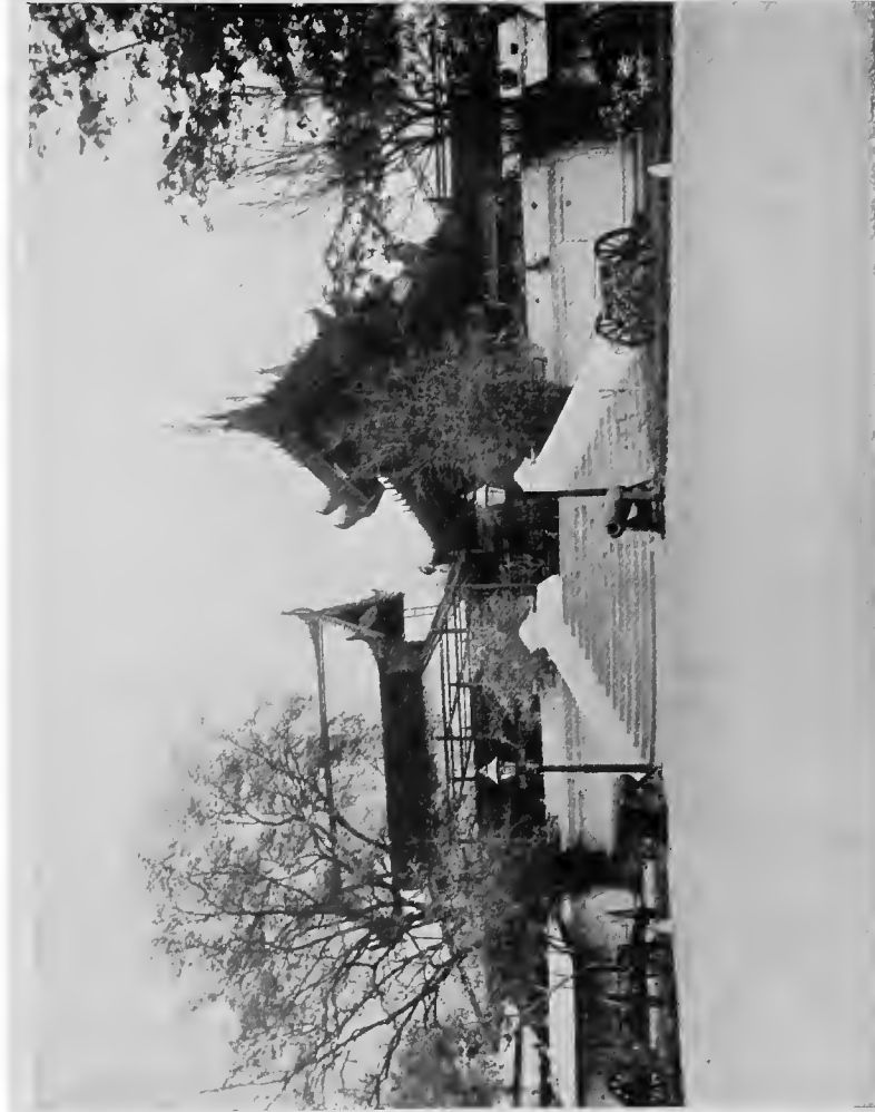
Upper Burmah Club, Mandalay